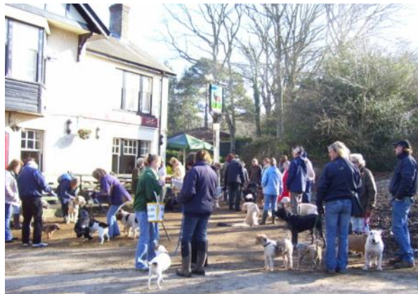
The start of the walk at the Red Shoot pub.

walk to promote exercise as part of a healthy lifestyle.